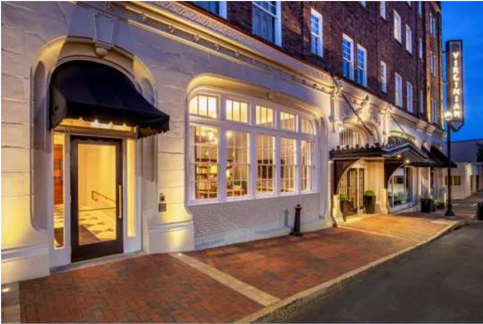
The Virginian Hotel, 712 Church Street, Lynchburg, VA (434) 616-4429